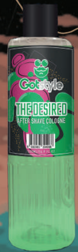
THE DESIRED GC05