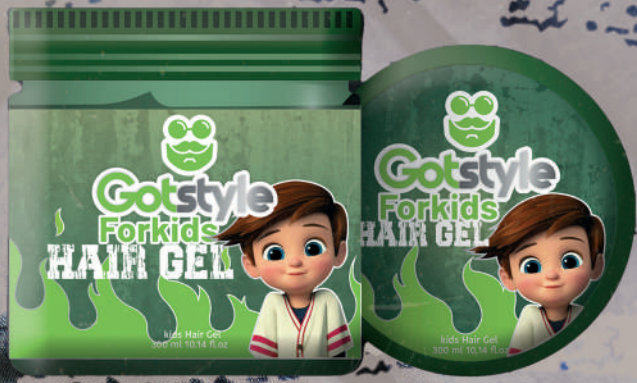
CROCODILE HAIR GEL