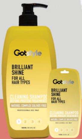
PROTEIN SET 1. CLEANING SHAMPOO