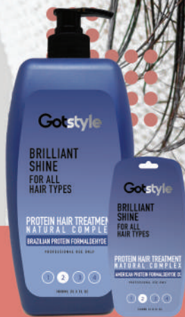
PROTEIN SET 2. PROTEIN HAIR TREATMENT