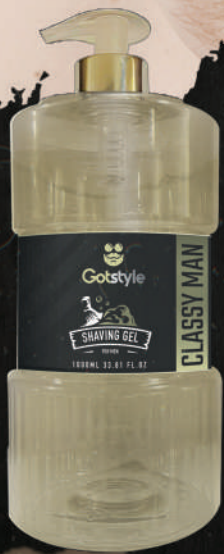
CLASSY MAN GSSGB01