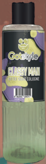
CLASSY MAN GC01