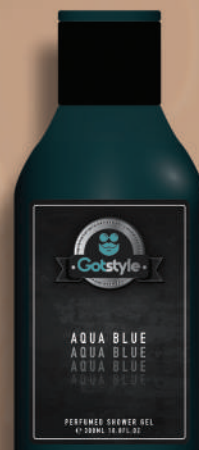
AQUA BLUE SHOWER GEL GSS01