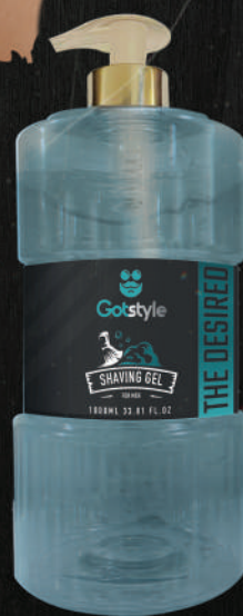
THE DESIRED GSSGB03