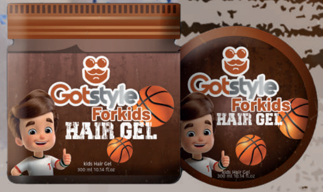
THE PLAYER HAIR GEL