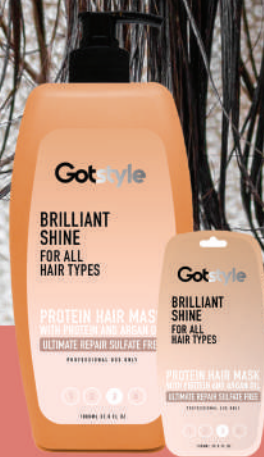
PROTEIN SET 2. PROTEIN HAIR MASK