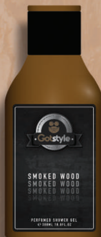
SMOKED WOOD SHOWER GEL GSS02