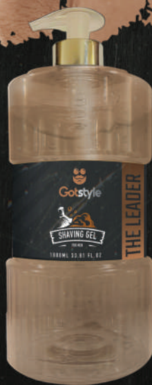
THE LEADER GSSGB02