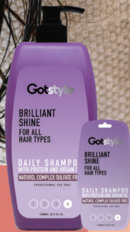
PROTEIN SET 2. DAILY SHAMPOO