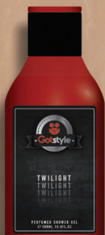
TWILIGHT SHOWER GEL GSS04