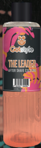
THE LEADER GC03