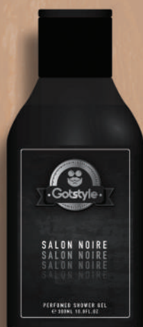
SALON NOIR SHOWER GEL GSS03